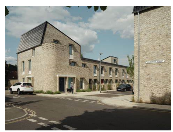
Goldsmith Street, Norwich is a development of ultra-low-energy homes which are estimated to reduce annual energy costs for residents by 70%.