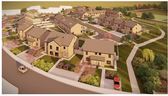
The recently completed Council housing development at the former Haldane School focussed on ensuring good access to the neighbouring park via a woodland walkway.

Typically on the edge of settlements these suburban housing should make the most of strong green network connections, trees on site and opportunities to connect to the wider countryside.