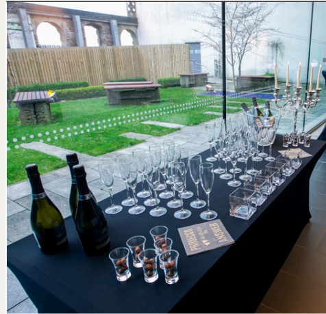
Desire - Bar