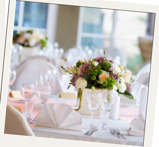
Top Class Catering