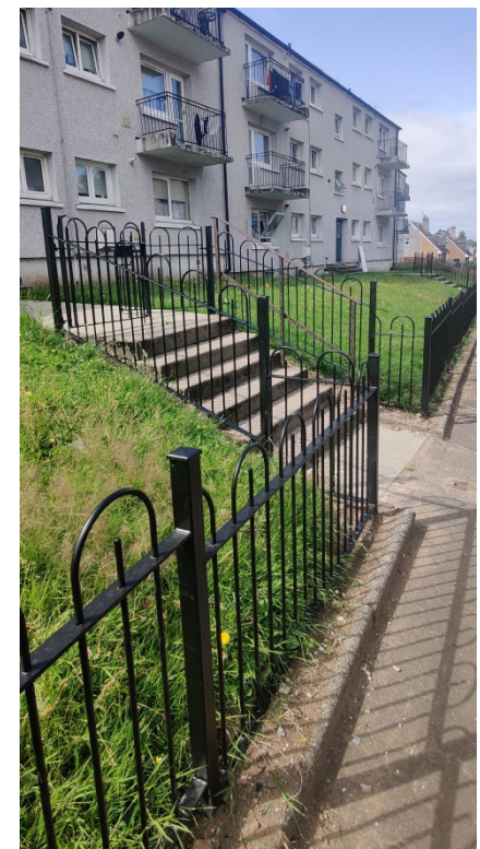
Craigielea Road – new fencing