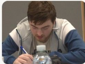
My name is Alan. I am 21 years old and my hobbies are photography