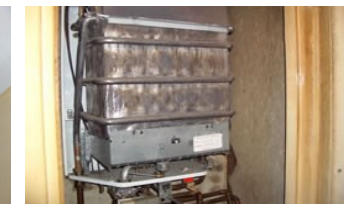
Surround at boiler