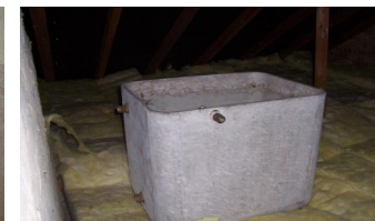
Cement water tank