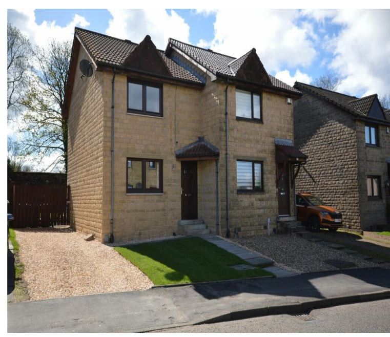
Case Study 1

This semi-detached property had been empty since 2015.