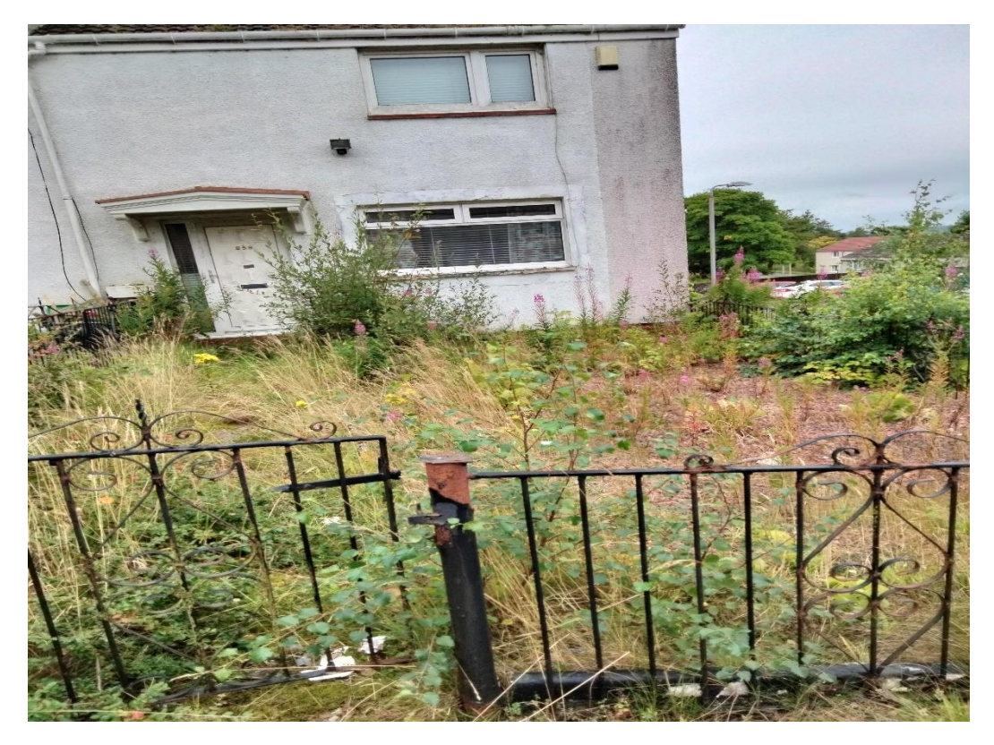
Case Study 2

This end terrace is a former West Dunbartonshire Council property and has been empty since 2014.